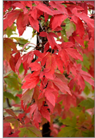
Paperbark Maple in fall

This tree does best in full sun to partial shade. It prefers to grow in average to moist conditions, and shouldn't be allowed to dry out. It is not particular as to soil type or pH. It is somewhat tolerant of urban pollution. This species is not originally from North America.