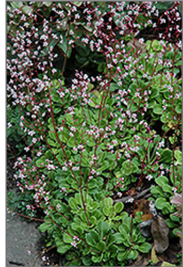
London Pride in bloom

London Pride is recommended for the following landscape applications;