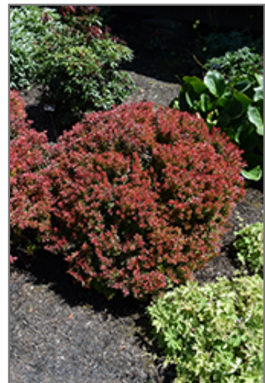
Golden Ruby Barberry