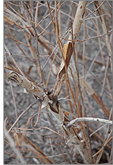
Diablo Ninebark bark

This shrub does best in full sun to partial shade. It is very adaptable to both dry and moist locations, and should do just fine under average home landscape conditions. It is not particular as to soil type or pH. It is highly tolerant of urban pollution and will even thrive in inner city environments. This is a selection of a native North American species.