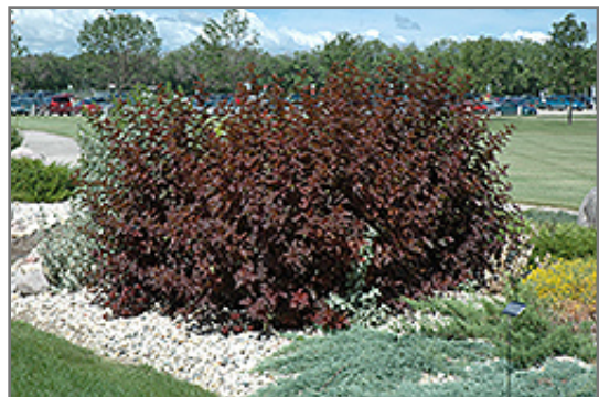
Diablo Ninebark