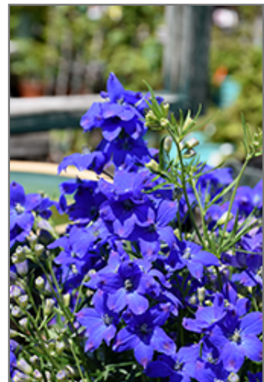
Diamonds Blue Delphinium flowers