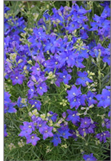
Diamonds Blue Delphinium flowers