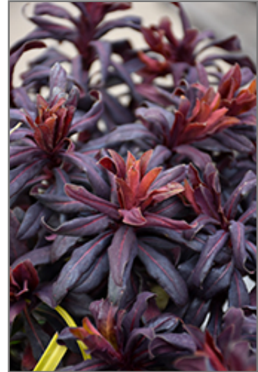
Ruby Glow Wood Spurge flowers

This is a relatively low maintenance plant, and should only be pruned after flowering to avoid removing any of the current season's flowers. Deer don't particularly care for this plant and will usually leave it alone in favor of tastier treats. It has no significant negative characteristics.