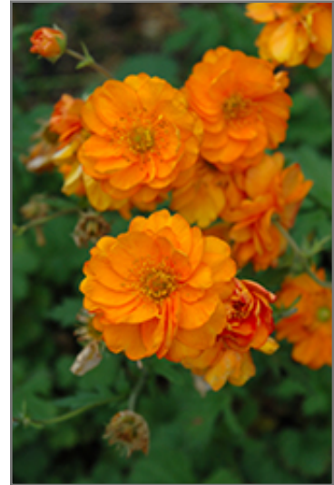
Fire Storm Avens flowers

Fire Storm Avens is recommended for the following landscape applications;