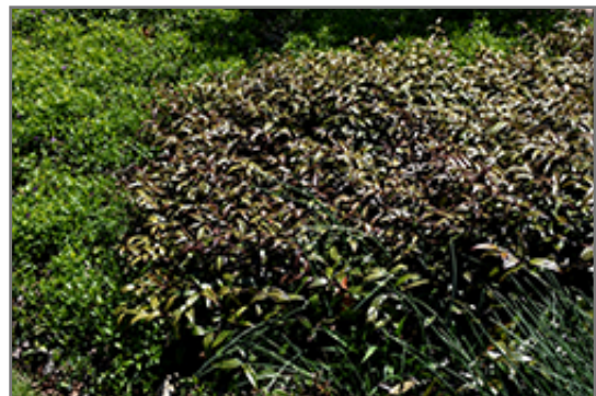
Scarletta Fetterbush