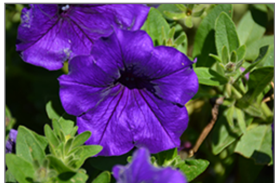
Easy Wave Blue Petunia flowers