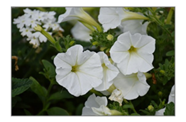
Supertunia White Petunia flowers