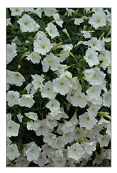
Supertunia White Petunia flowers