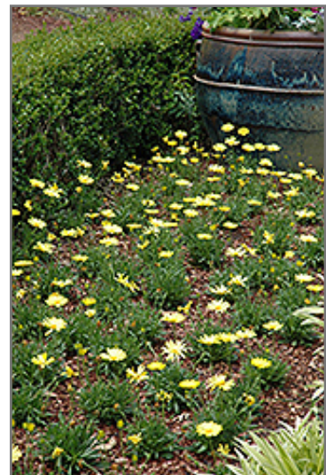
Voltage Yellow African Daisy flowers