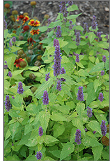
Golden Jubilee Anise Hyssop flowers

Golden Jubilee Anise Hyssop is a dense herbaceous perennial with an upright spreading habit of growth. Its medium texture blends into the garden, but can always be balanced by a couple of finer or coarser plants for an effective composition.