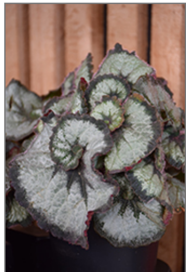
Escargot Begonia foliage