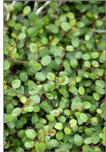
Creeping Wire Vine foliage