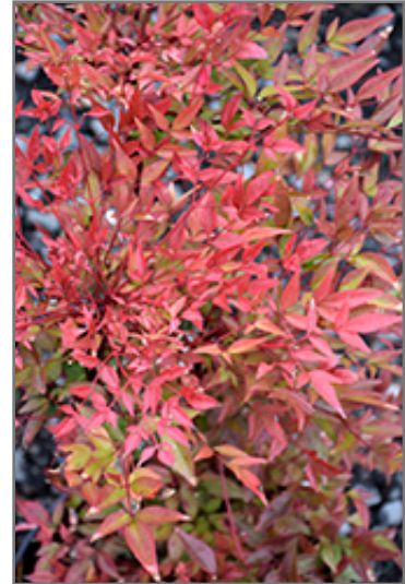
Obsession Nandina foliage