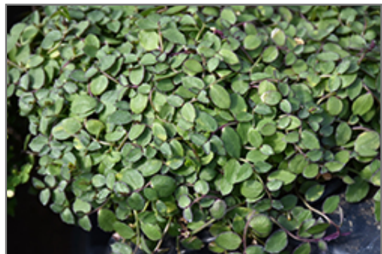
County Park Star Creeper foliage