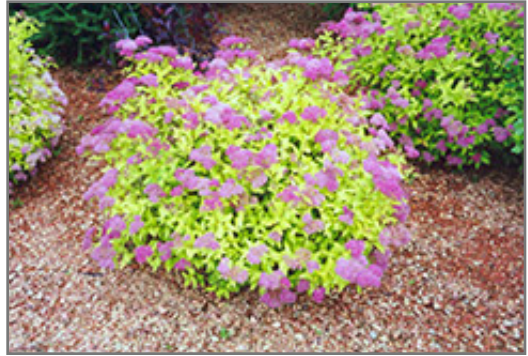
Goldmound Spirea in bloom

This shrub should only be grown in full sunlight. It prefers to grow in average to moist conditions, and shouldn't be allowed to dry out. It is not particular as to soil type or pH. It is highly tolerant of urban pollution and will even thrive in inner city environments. This is a selected variety of a species not originally from North America.