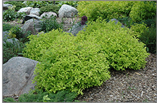
Goldmound Spirea

Goldmound Spirea is recommended for the following landscape applications;