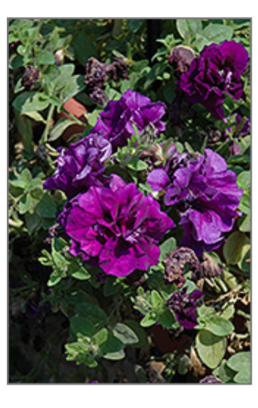
Double Wave Blue Velvet Petunia flowers