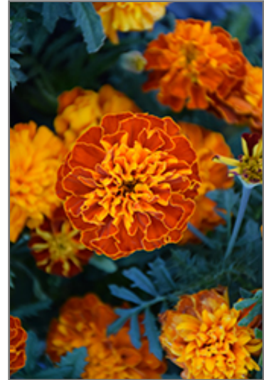
Bonanza Harmony Marigold flowers