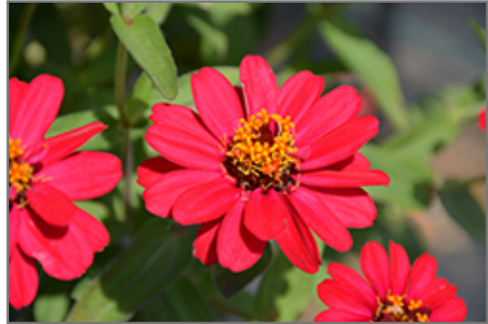
Profusion Double Hot Cherry Zinnia flowers