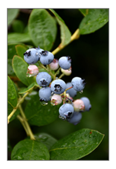
Jersey Blueberry fruit