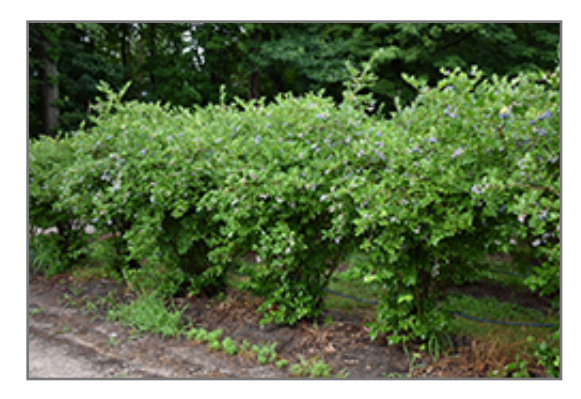
Jersey Blueberry fruit