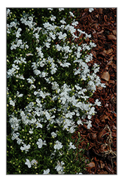
White Palace Lobelia flowers