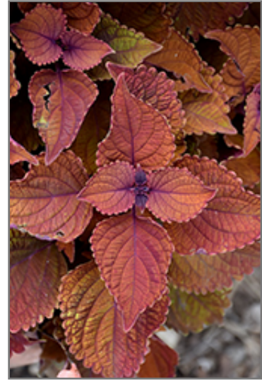
Wall Street Coleus foliage