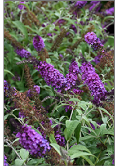
Buzz Purple Butterfly Bush flowers