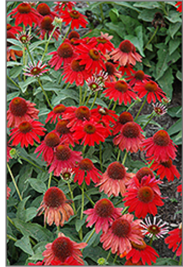
Sombrero Salsa Red Coneflower flowers

This is a relatively low maintenance plant, and is best cleaned up in early spring before it resumes active growth for the season. It is a good choice for attracting butterflies to your yard, but is not particularly attractive to deer who tend to leave it alone in favor of tastier treats. It has no significant negative characteristics.