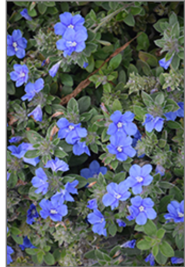
Blue My Mind Morning Glory flowers

Blue My Mind Morning Glory is recommended for the following landscape applications;