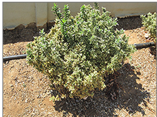
Variegated Boxleaf Japanese Euonymus