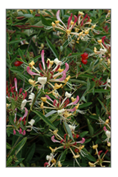
Sweet Tea Honeysuckle flowers