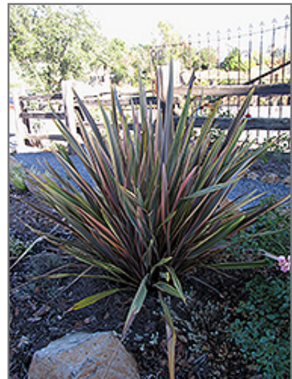
Rainbow Sunrise New Zealand Flax