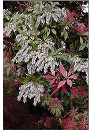
Valley Fire Japanese Pieris flowers

Valley Fire Japanese Pieris is recommended for the following landscape applications;