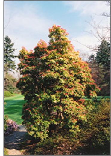
Valley Fire Japanese Pieris

This shrub does best in full sun to partial shade. It requires an evenly moist well-drained soil for optimal growth, but will die in standing water. It is very fussy about its soil conditions and must have rich, acidic soils to ensure success, and is subject to chlorosis (yellowing) of the foliage in alkaline soils. It is somewhat tolerant of urban pollution, and will benefit from being planted in a relatively sheltered location. Consider applying a thick mulch around the root zone in winter to protect it in exposed locations or colder microclimates. This is a selected variety of a species not originally from North America, and parts of it are known to be toxic to humans and animals, so care should be exercised in planting it around children and pets.