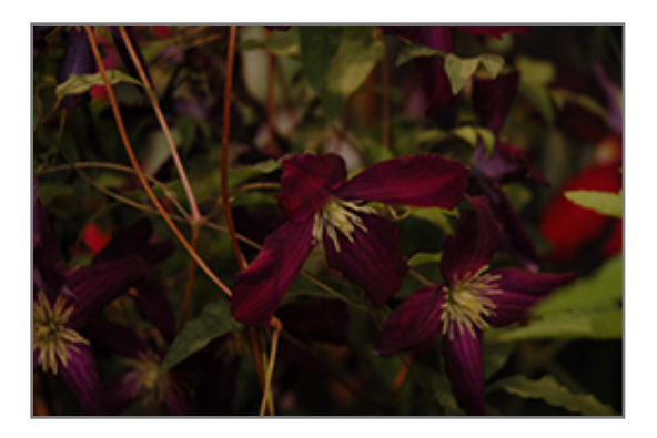
Sweet Summer Love Clematis flowers

1020 S 42nd St Springfield, OR 97478 (541) 744-0372 littleredfarmnursery.com