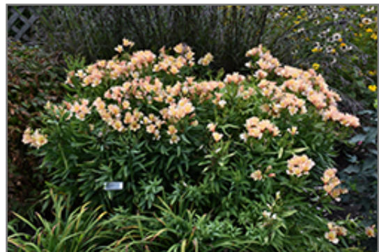
Inca Ice Alstroemeria in bloom