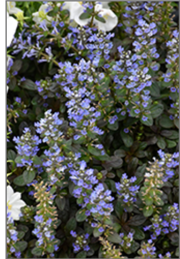
Chocolate Chip Bugleweed flowers

Chocolate Chip Bugleweed is recommended for the following landscape applications;