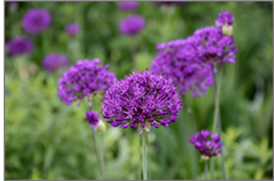
Purple Sensation Ornamental Onion flowers

Purple Sensation Ornamental Onion is an open herbaceous perennial with tall flower stalks held atop a low mound of foliage. Its relatively coarse texture can be used to stand it apart from other garden plants with finer foliage.