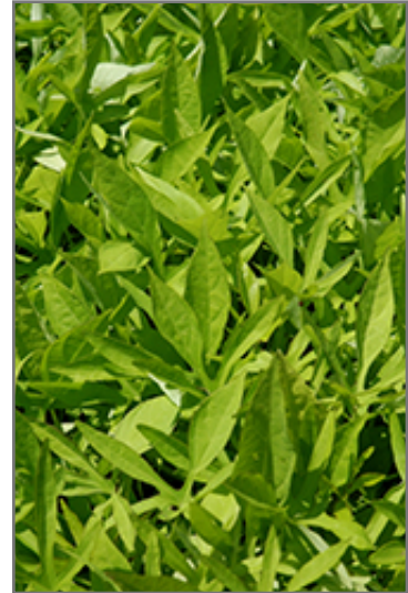
SolarPower Lime Sweet Potato Vine foliage