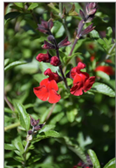
Radio Red Autumn Sage flowers