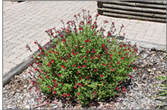
Radio Red Autumn Sage in bloom