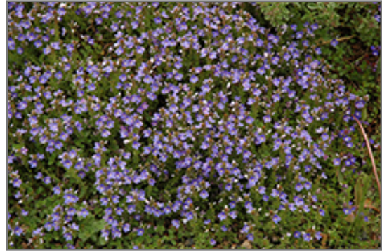
Turkish Speedwell in bloom

This is a relatively low maintenance plant, and should only be pruned after flowering to avoid removing any of the current season's flowers. It is a good choice for attracting butterflies to your yard, but is not particularly attractive to deer who tend to leave it alone in favor of tastier treats. It has no significant negative characteristics.