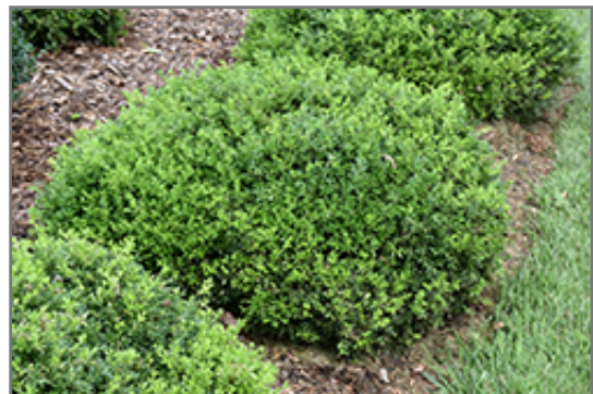
Tide Hill Boxwood