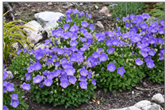
Rapido Blue Bellflower in bloom