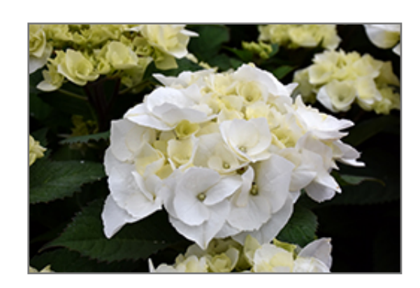
Zebra Hydrangea flowers