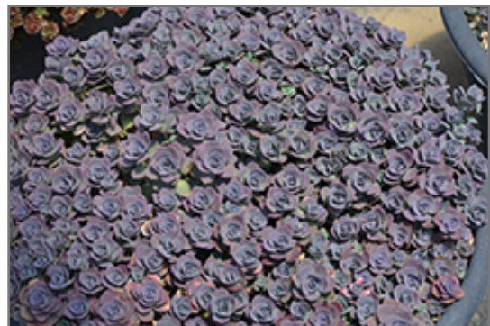
SunSparkler Blue Elf Sedoro