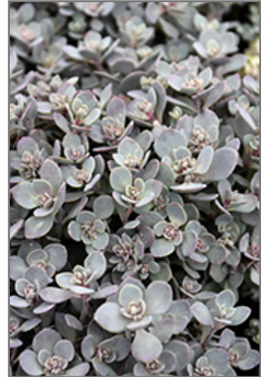
SunSparkler Blue Elf Sedoro foliage

SunSparkler Blue Elf Sedoro is a fine choice for the garden, but it is also a good selection for planting in outdoor pots and containers. Because of its spreading habit of growth, it is ideally suited for use as a 'spiller' in the 'spiller-thriller-filler' container combination; plant it near the edges where it can spill gracefully over the pot. Note that when growing plants in outdoor containers and baskets, they may require more frequent waterings than they would in the yard or garden.