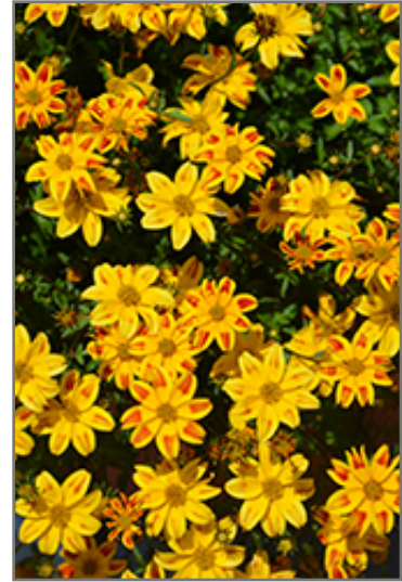
Beedance Red Stripe Bidens flowers

Beedance Red Stripe Bidens is recommended for the following landscape applications;