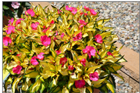
SunPatiens Compact Tropical Rose New Guinea Impatiens in bloom