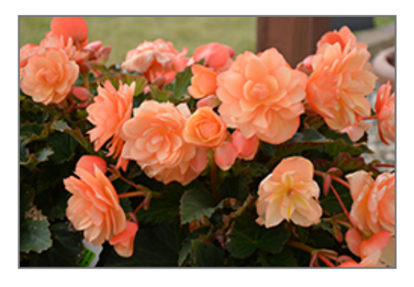
Fragrant Falls Peach Begonia flowers