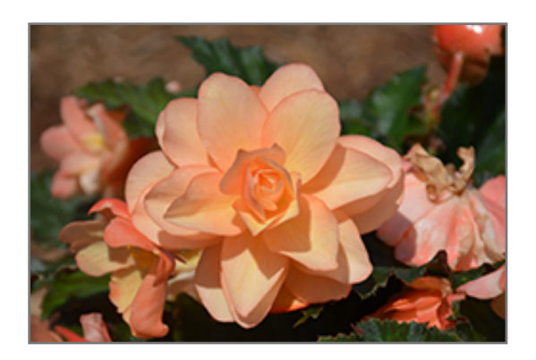
Fragrant Falls Peach Begonia flowers