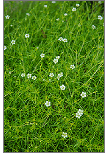
Scotch Moss flowers