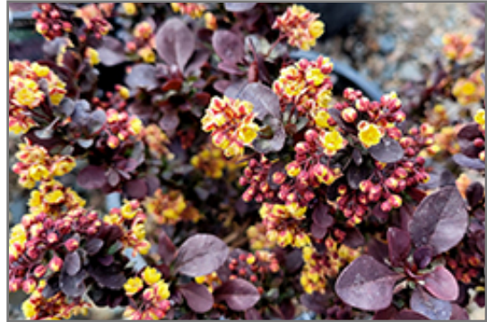
Concorde Japanese Barberry flowers

Concorde Japanese Barberry will grow to be about 18 inches tall at maturity, with a spread of 24 inches. It tends to fill out right to the ground and therefore doesn't necessarily require facer plants in front. It grows at a slow rate, and under ideal conditions can be expected to live for approximately 20 years.