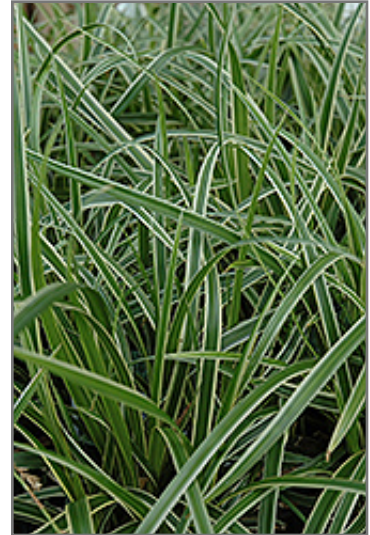
Ice Dance Sedge foliage

Ice Dance Sedge is recommended for the following landscape applications;