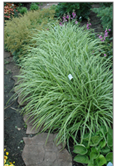
Ice Dance Sedge