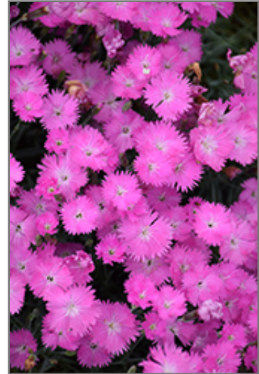
Firewitch Pinks flowers

Firewitch Pinks is recommended for the following landscape applications;