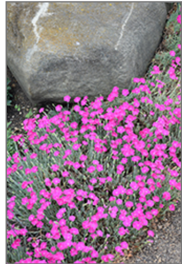
Firewitch Pinks in bloom

Firewitch Pinks is a fine choice for the garden, but it is also a good selection for planting in outdoor pots and containers. It is often used as a 'filler' in the 'spiller-thriller-filler' container combination, providing a mass of flowers and foliage against which the thriller plants stand out. Note that when growing plants in outdoor containers and baskets, they may require more frequent waterings than they would in the yard or garden.