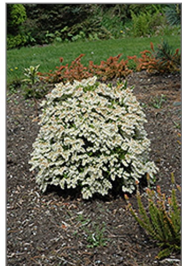
Prelude Japanese Pieris in bloom