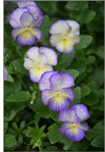
Etain Pansy flowers

Etain Pansy is recommended for the following landscape applications;